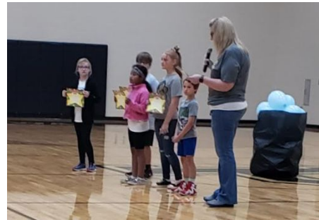
Highlights from the first Paw Wow of the year

https://www.cdc.gov/parasites/lice/head/gen_info/index.htm